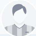
Kyleigh Batory Class of 2028 • Not Committed